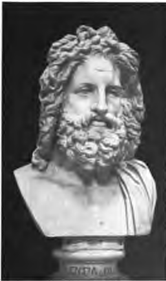
Fig. 5. Head of Zeus.

ing tree-tops grew over their heads, each said: "Farewell, O Wife! O Husband!" and then the bark covered their mouths. And so, in after years, the shepherds pointed out the oak and the linden growing side by side, and said: "The